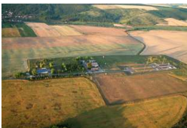
Bird view of the site