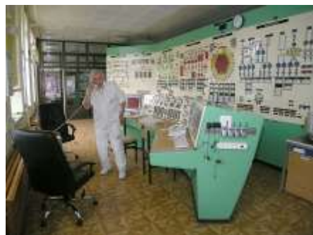
BRR control room