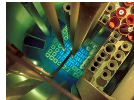
Active core of BUTE