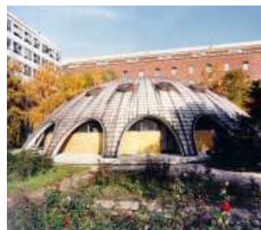
BUTE reactor building