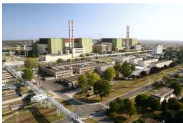
Bird view form Paks NPP's