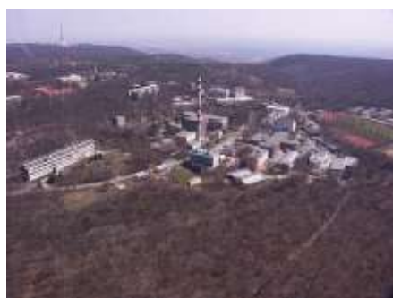
Bird view from BRR site