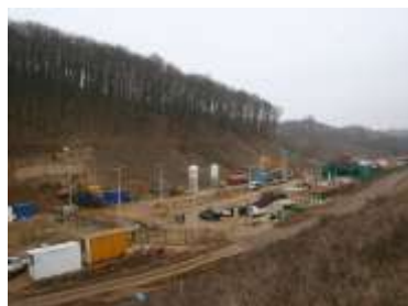
Site (under construction)

Geological repository in Bataapati /near Paks/